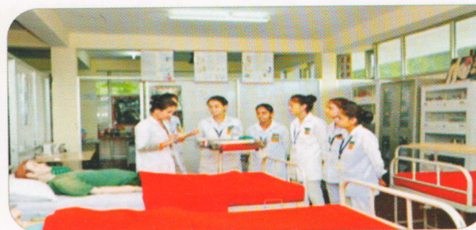
Nursing Foundation Lab