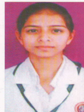
Kiran Chaudhary Govt. Hospital Dharamshala